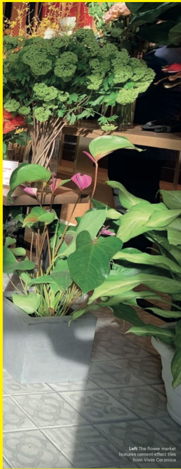
Left The flower market features cement-effect tiles from Vives Ceramica

At the centre of the market is the Spanish Diner. World Streets porcelain floor tiles were used for the floor, which is contrasted dramatically with floral patchwork wall tiles, Patchwork-12, on the main bar. The Bar Celona cocktail bar features an imaginative mix of Vives' wood-effect ceramic tiles, including Gamma Miel on the floor.