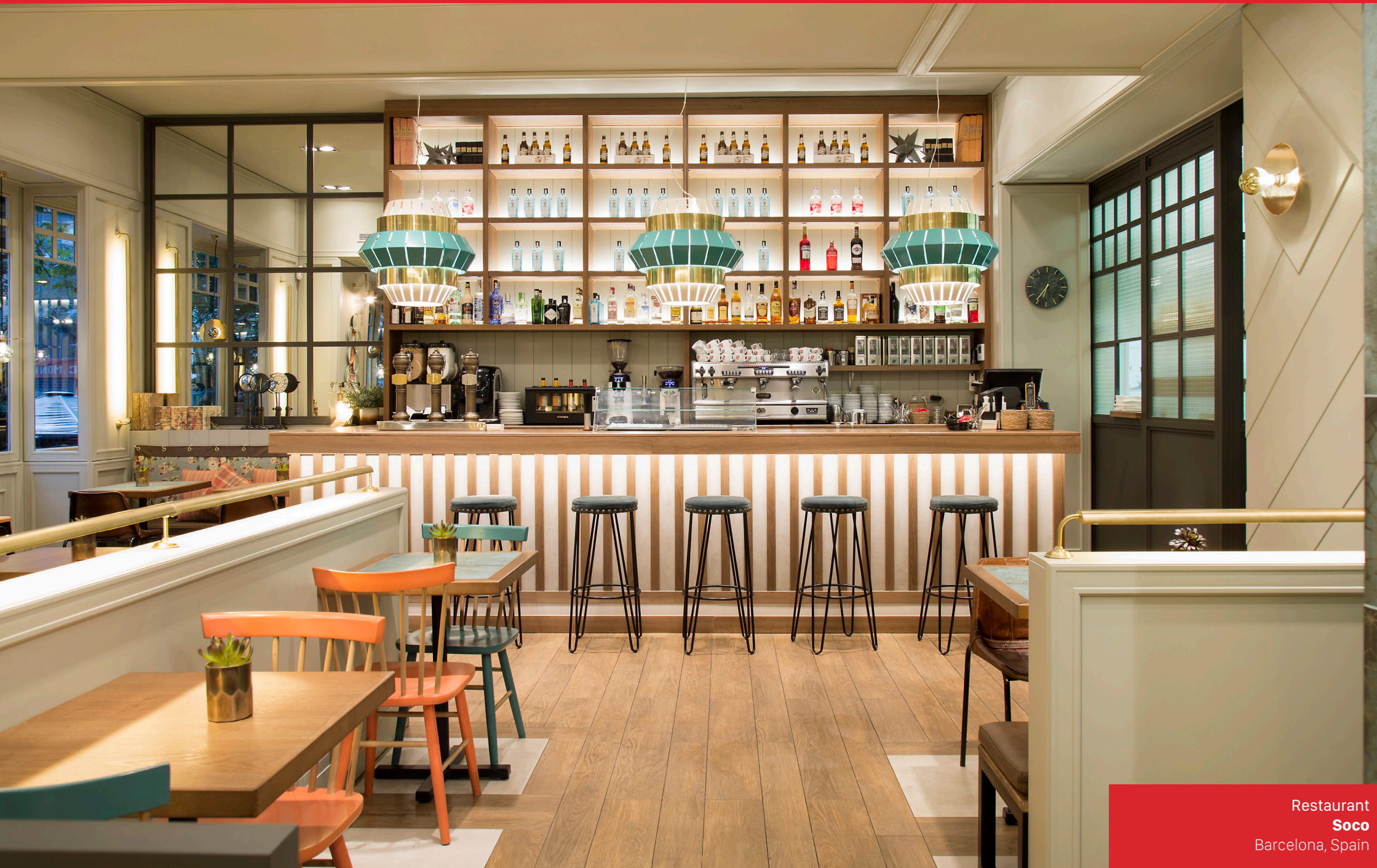
Restaurant Soco Barcelona, Spain