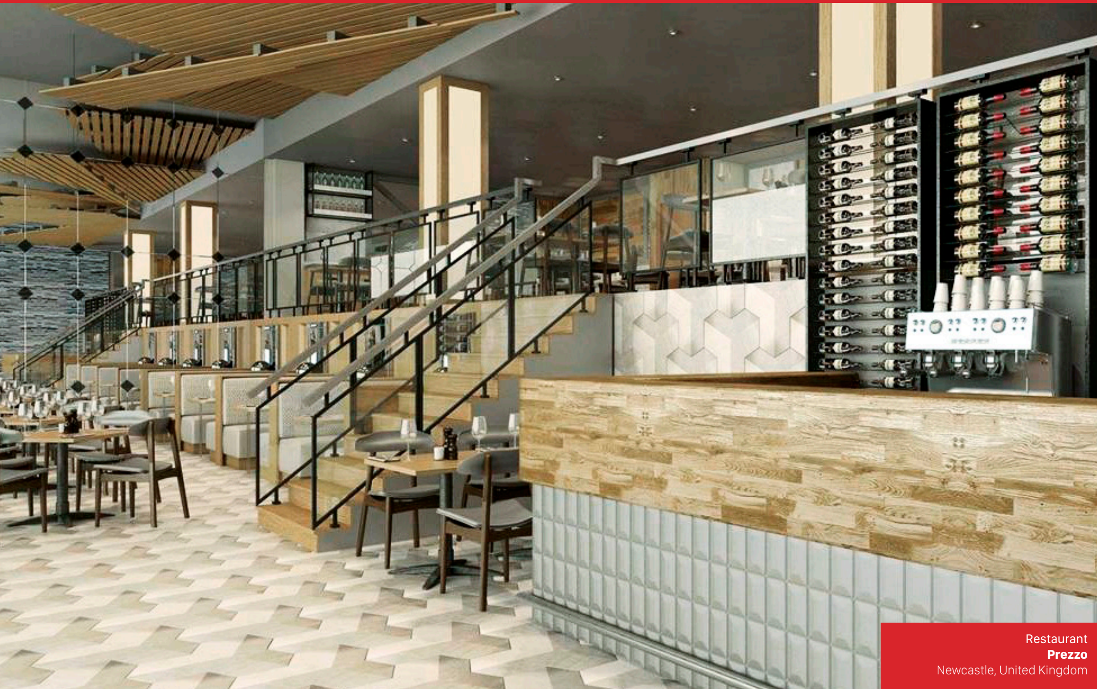
Restaurant Prezzo Newcastle, United Kingdom